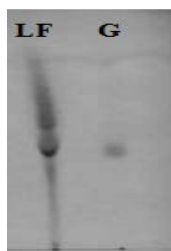
Fig. 1: Thin Layer chromatography analysis of GABA production by L. fermentum 101 after 72-hour cultivation with MSG. (G): standard GABA; (LF): L. fermentum 101

After checking GABA production on TLC, L. fermentum 101 exhibited strong spots for GABA production when MSG presenting in growth medium. The Rf value of L. fermentum 101 was nearly the same as the authentic GABA production (Fig.1).