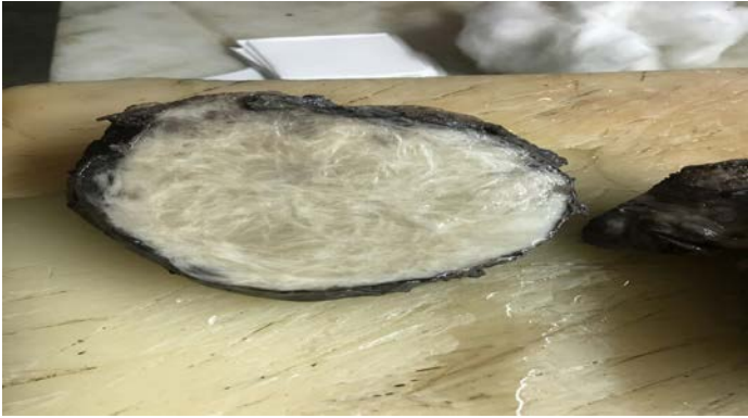
Fig.1: gross of Neuro fibroma

serpentine or wavy nucleus. These histopathological features are consistent with Neurofibroma. Immunohistochemistry showed S 100 positivity and was negative for smooth muscle actin and activin receptor like kinase. This confirmed the diagnosis of Neurofibroma.