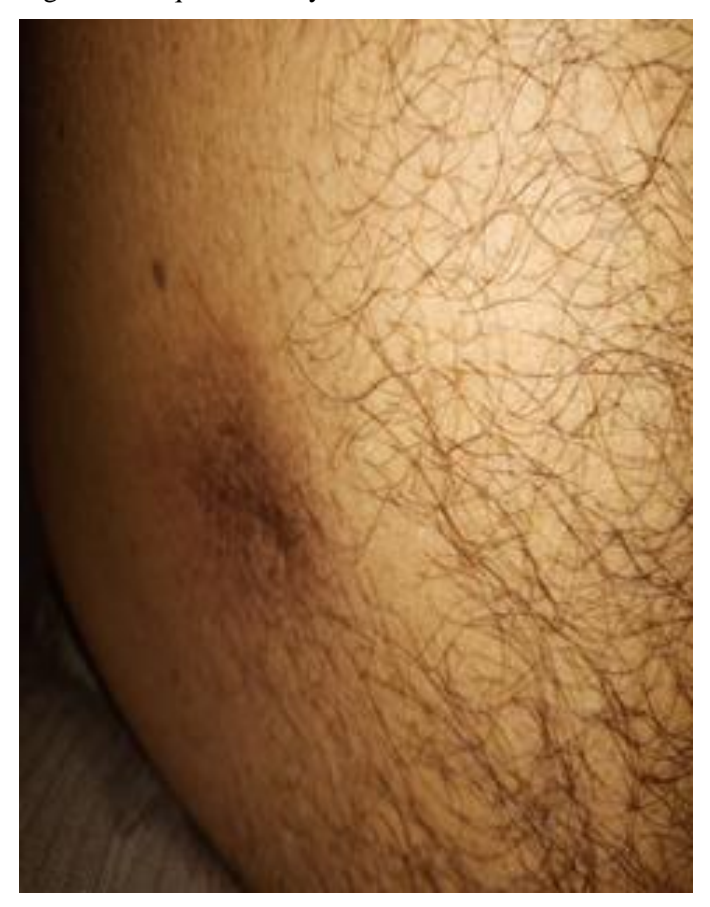
Figure 4: Insulin injection induced lipoatrophy