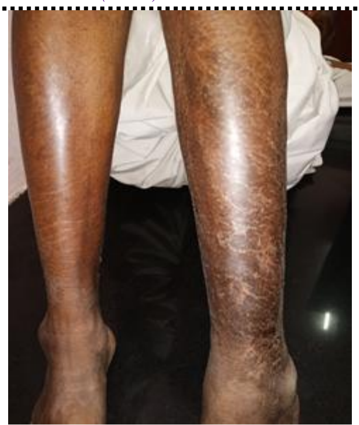
Figure 3: Acquired ichthyosis