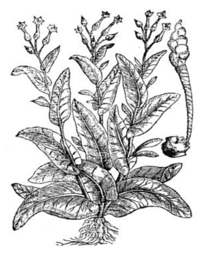
Figure 1: The first published illustration of Nicotiana tabacum by Pena and De L'Obel, 1570–1571 (shrpiumadversana nova: London). The small illustration

About 10% of the dry weight of tobacco is made up of tobacco protein and amino acids. Alkaloids and volatile bases make up around 4% of the weight of tobacco. About 10% of the dry tobacco's weight is made up of waxes and resins, which can be extracted using ether. 7.8% of the tobacco weight is made up of metals (6.0%) and inorganic ions (1.8%). About 8 and 11% of the weight of dry tobacco is made up of phenolics and acids, respectively. <sup>[3]</sup>