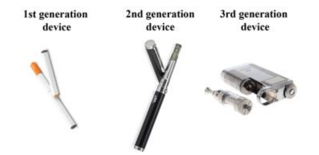
Figure 4: Examples of electronic cigarette devices currently available on the market.

3) Third-generation devices (also called 'Mods', from modifications)utilising extremely large lithium batteries that have integrated circuits that let users adjust the voltage or power (wattage) sent to the atomizer.