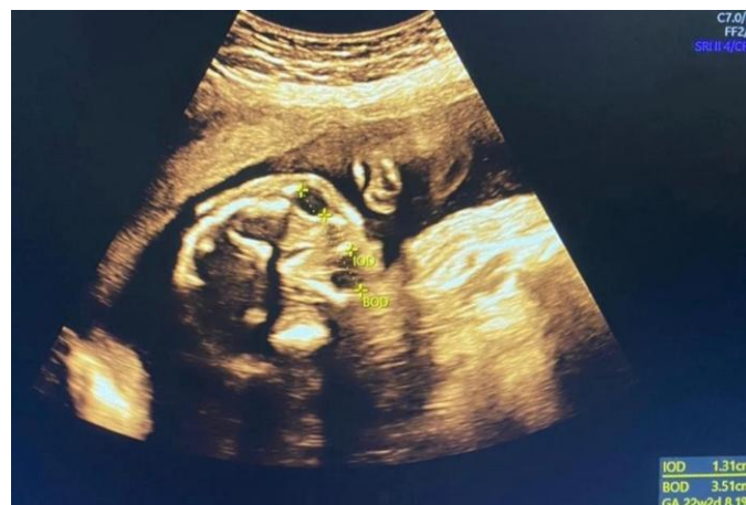
Figure 1: An ultrasound image showing measurement of interorbital distance (IOD) and biorbital distance (BOD) in axial plane in a pregnant women in 22 week of gestation.

the syndromes and anomalies that is associated with abnormal IOD.