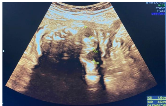
Figure 2: An ultrasound image showing measurement of interorbital distance (IOD) and biorbital distance (BOD) in coronal plane in a pregnant women in 23 week of gestation.

Hypertelorism is a congenital anomaly characterized by widely spaced eyes [widened IOD]; often associated with Apert syndrome, Pfeiffer syndrome, and Crouzon syndrome. [7] Microphthalmia, a congenital anomaly with reduced IOD, often associated with anomalies like Hallermann-Streiff syndrome and Waardenburg syndrome. Down syndrome and Turner syndrome [8] are genetic disorders causing intellectual disability and facial