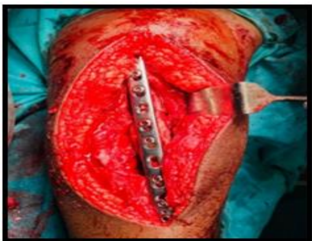
Figure 2: Intraoperative fixation