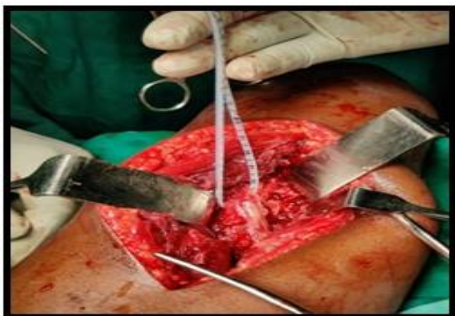
Figure 1: Intraoperative radial nerve isolation